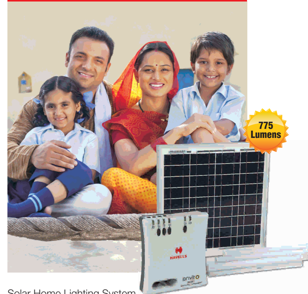
Solar Home Lighting System Enviro SH351