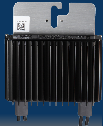
Optimizers-To extract max. Energy from each and every module