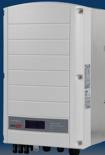
On Grid Inverters from 2.2Kva to 27.6Kva