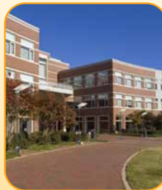
School | College | University