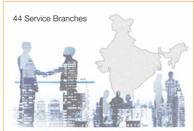
Strong service network across India