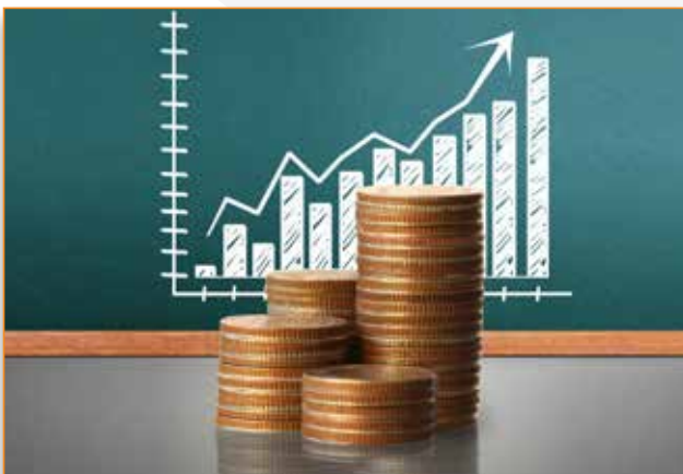
Company with strong financial strength