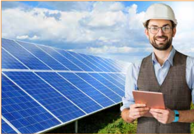
Strong design engineering team